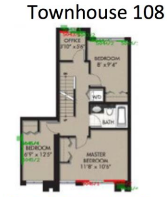
Figure 3: Sensors having elevated moisture content in the 2<sup>nd</sup> floor of Townhouse 108.

The presentation will show various leak investigations were the sensor data assisted with exacting the location of the water source, identifying causes and provide evidence based conclusions.