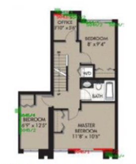
Figure 3: Sensors having elevated moisture content in the 2<sup>nd</sup> floor of Townhouse 108.